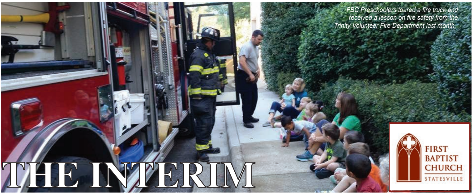
FBC Preschoolers toured a fire truck and received a lesson on fire safety from the Trinity Volunteer Fire Department last month.