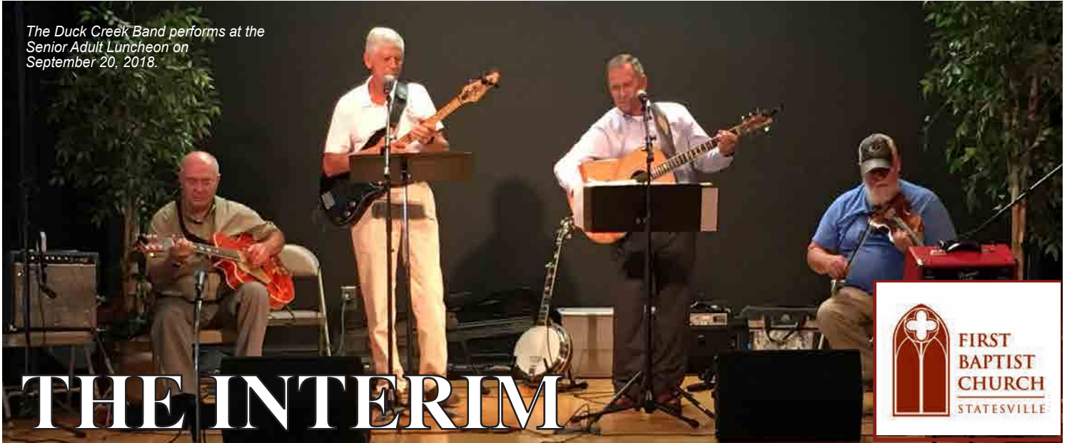
The Duck Creek Band performs at the Senior Adult Luncheon on September 20, 2018.